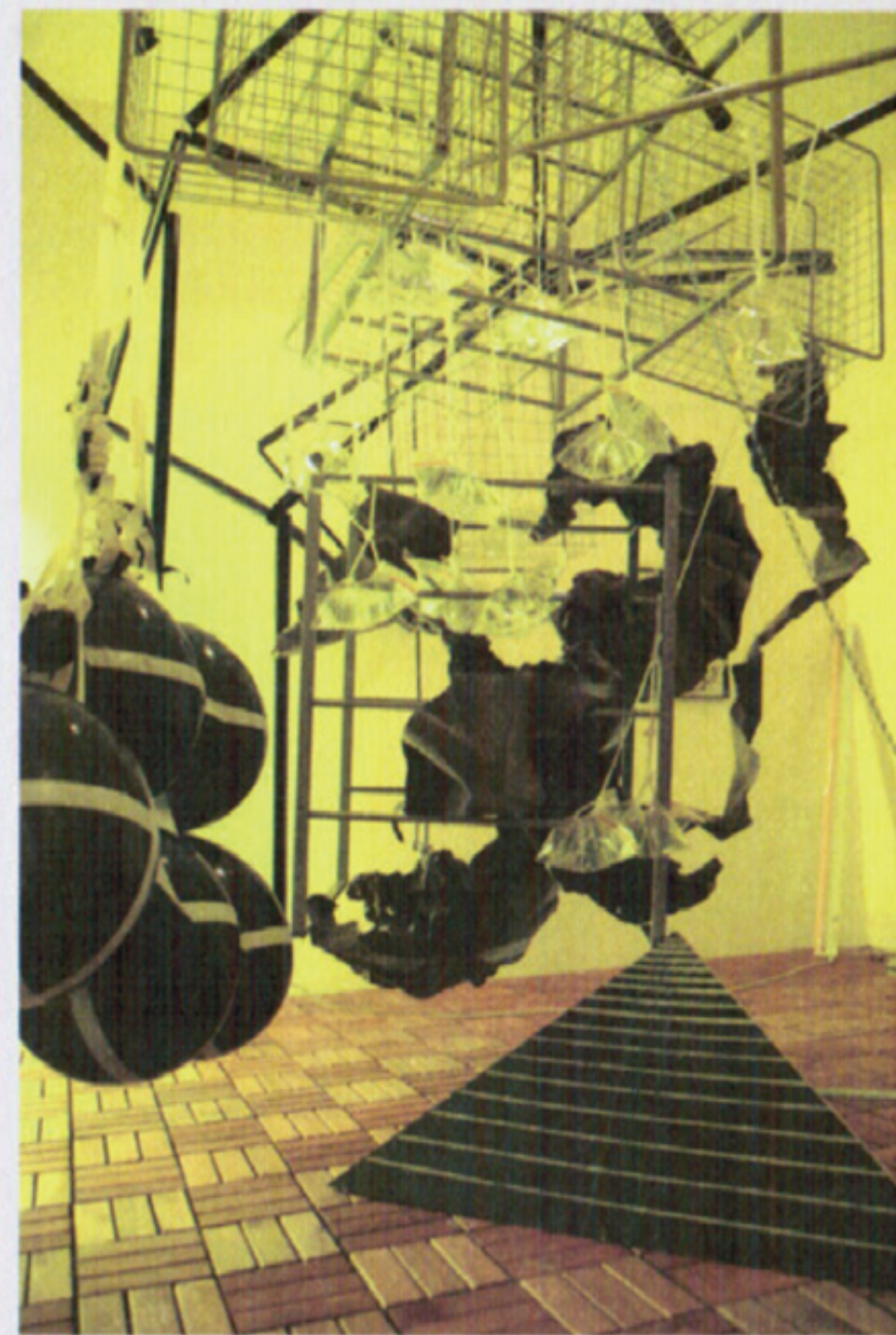
Soo-Joo Yoo, MULTIPLE TEMPORALITIES , 2012, water, air, pipes, mount boards, damp course, picture frame, tiles, bricks, stones, glass, ropes, wires, hooks, chains, vinyl, balloons, white tapes, black tapes, plaster powder, aluminium poles, fluorescent lights, zip-bags, drawers, drawers cases, stretch wrapping and water colour pencils, 307 x 780 x 482 cm.

towers of wire drawers, rickety frameworks of aluminium tubes, counterweighing pulleys, ropes, helium-filled balloons and zip-lock bags filled with water – also worked to challenge and deconstruct our understanding of the space and the forces at play within it. As the title suggested, her MULTIPLE TEMPORALITIES , 2012, also addressed notions of time, the effects of the gradual evaporation of water